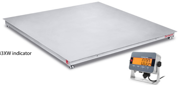
Stainless steel platform shown with i-DT33XW indicator