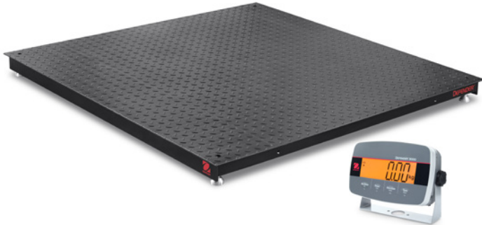
Painted carbon steel platform shown with i-DT33P indicator