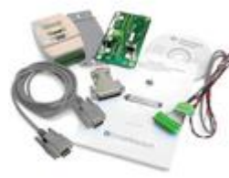
EVAL KIT Evaluations kits for DCell and DSC are available for stress free set up. Strain gauge data converter to RS232. Modbus, CAN, RS885