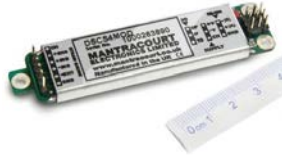
DSC Strain gauge data converter to RS232. Modbus, CAN, RS885