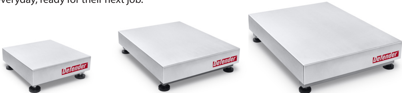
305 x 355mm (12 x 14 inches)

With bases ranging from 15kg (30lbs) in 305 x 355mm (12 x 14 inches) up to 600kg (1,200lbs) in 600 x 800mm (23.6 x 31.5 inches), our bases are OIML (NTEP & Measurement Canada) certified. Designed to meet basic industrial needs, the Defender 3000 is made to perform everyday, ready for their next job.