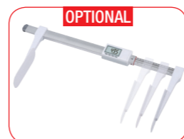
OPTIONAL Mechanical telescopic height digital reading