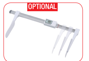
OPTIONAL Mechanical telescopic height digital reading