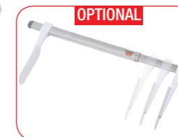
OPTIONAL Mechanical telescopic height rod