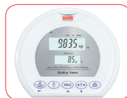
Double LCD: 1°LCD weight 2°LCD function quantity milk