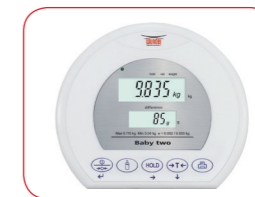
Function HOLD weight