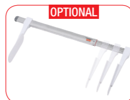
OPTIONAL Mechanical telescopic height rod