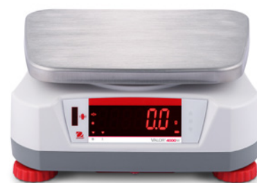
Rear Display with Integrated Touchless Sensor