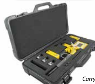
Carry case included

Dillon also manufactures highly accurate electronic and mechanical dynamometers and crane scales.