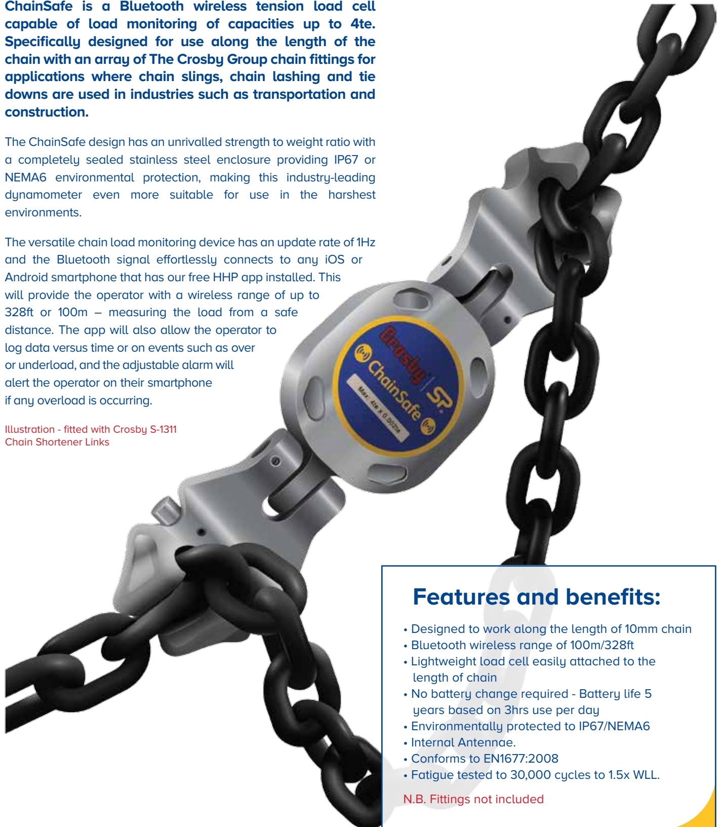
Illustration - fitted with Crosby S-1311 Chain Shortener Links

The versatile chain load monitoring device has an update rate of 1Hz and the Bluetooth signal effortlessly connects to any iOS or Android smartphone that has our free HHP app installed. This will provide the operator with a wireless range of up to 328ft or 100m – measuring the load from a safe distance. The app will also allow the operator to log data versus time or on events such as over or underload, and the adjustable alarm will alert the operator on their smartphone if any overload is occurring.