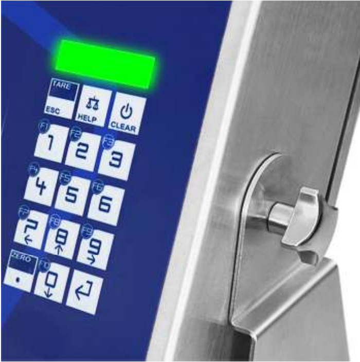
High brightness LED crosslight and mechanical keyboard.