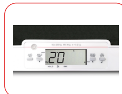
Double-read Display Weight/BMI Patient