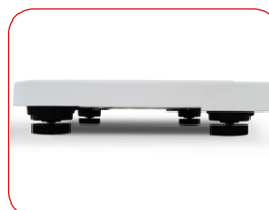
Large Platform with adjustable feet