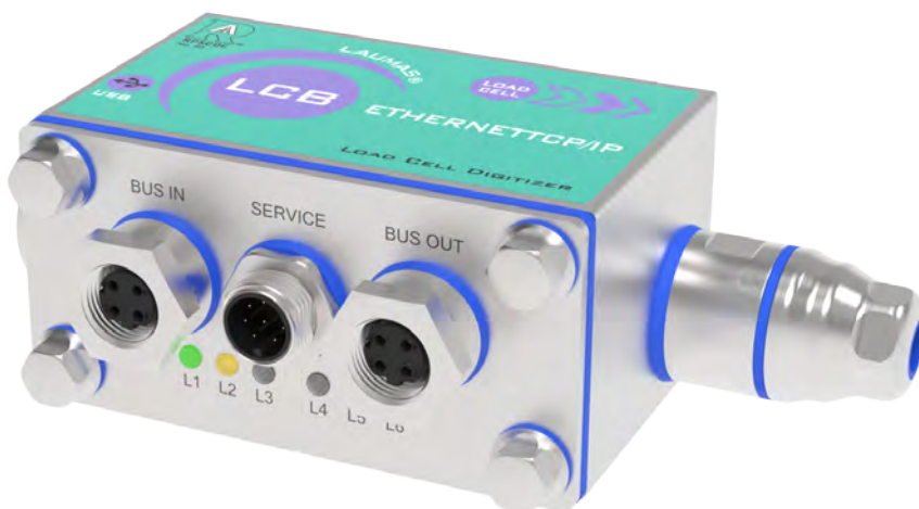
MICRO USB FOR PC CONFIGURATION