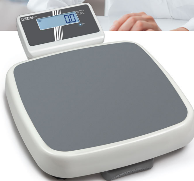
KERN MPD 250K100M