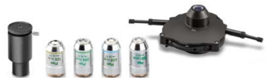
Quintuple PH universal rotary condenser with 10×/20×/40×/100× Infinity PH-Plan objectives (complete set, for OBN-15 included)