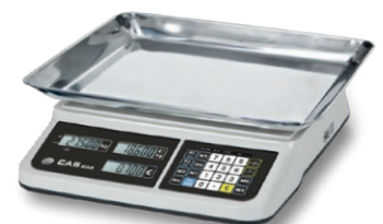
Tray perfect for loose goods – 360×280×55 mm

The PR-II comes complete with both vendor and customer displays. Vendor and customer can see weight and price of desired goods at same time.