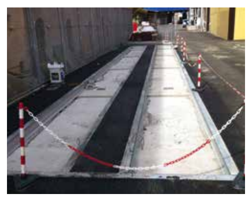
Example of an installation on an asphalt weighing surface