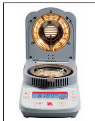
The OHAUS MB23 comes with an infrared heating element, while the MB25 uses halogen technology