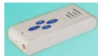
Remote Control is standard